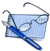
Chart covering the Bema Seat is in teacher's appendix if teacher desires to teach more on the subject at this time.

Believers receive Christ's righteousness at salvation. The fine linen, here, speaks of works performed by the believer while filled with the Spirit: Divine good works that survive the fire at the evaluation (Bema Seat) and are rewarded. Christ performed those works through willing, humble believers, subordinate stewards and bond-servants, who were faithful to the master. (Display "Survival of Fire" visuals if desired.)